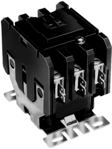
Approximate Overall Dimensions 3 3/4" x 2 5/8" x 3 1/2" (92-459 thru 92-465)